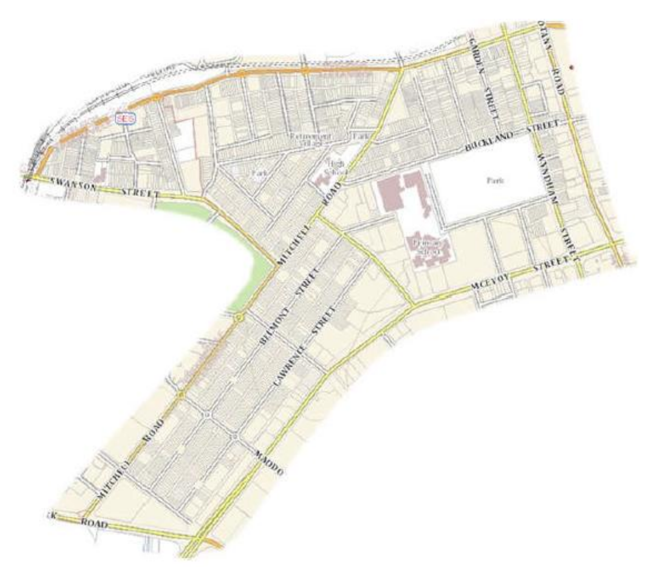
Figure 1.1: Study Area